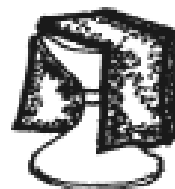
CHALICE & PURIFICATOR